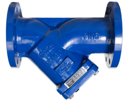
FIG 13Y1 (With Epoxy Coating)